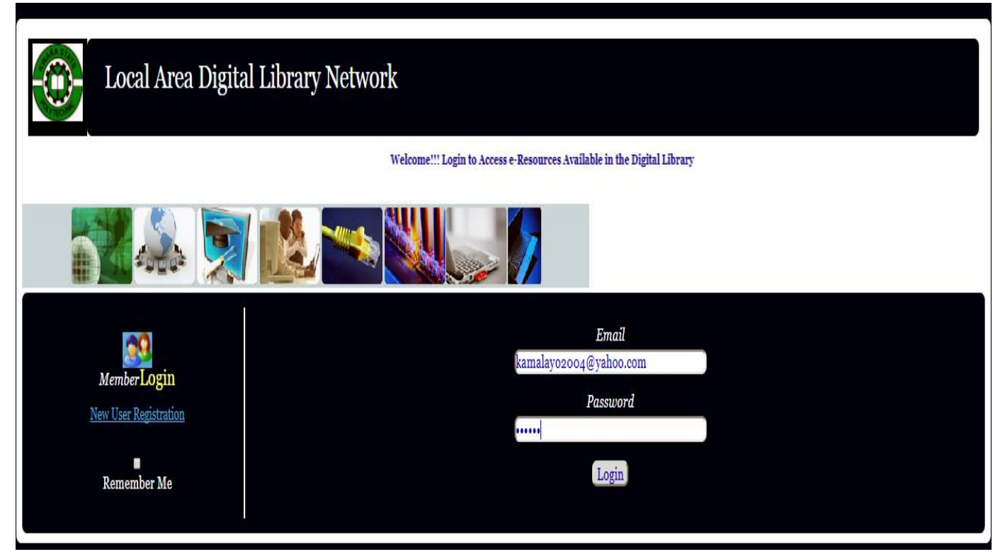
Figure 2: Login Menu to digital library

The Digital Library Network (DLN) has an up-to-date scientific approach within research, by implementing and disseminating new interdisciplinary views in the field of Computer Science and Technology. By means of integrating the specialty studies of highly reputed researches, this DLN has the latest information in the field of Computer Science, applicable to many investigation domains. After successful log-in as there are seven links available as shown in figure 3 below, these are E-Books, E-Videos, E-Articles, E-Library, Virtual Library, Student e-Resources, and About the Researchers.