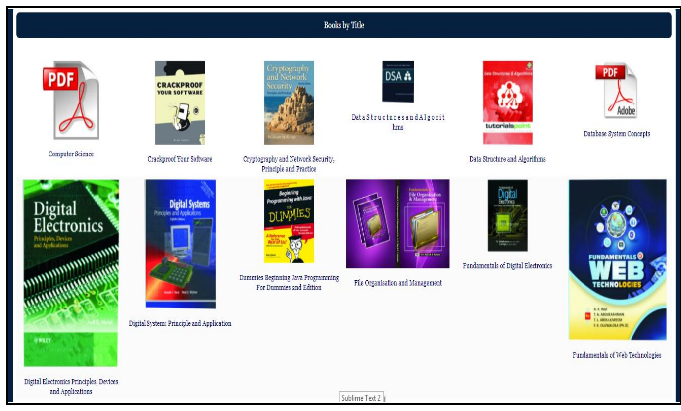
Figure 4: Screenshot showing list of books by title

E-Books: This link allows users to view/download books either by title (as shown in figure 4), by author's name or by subject.