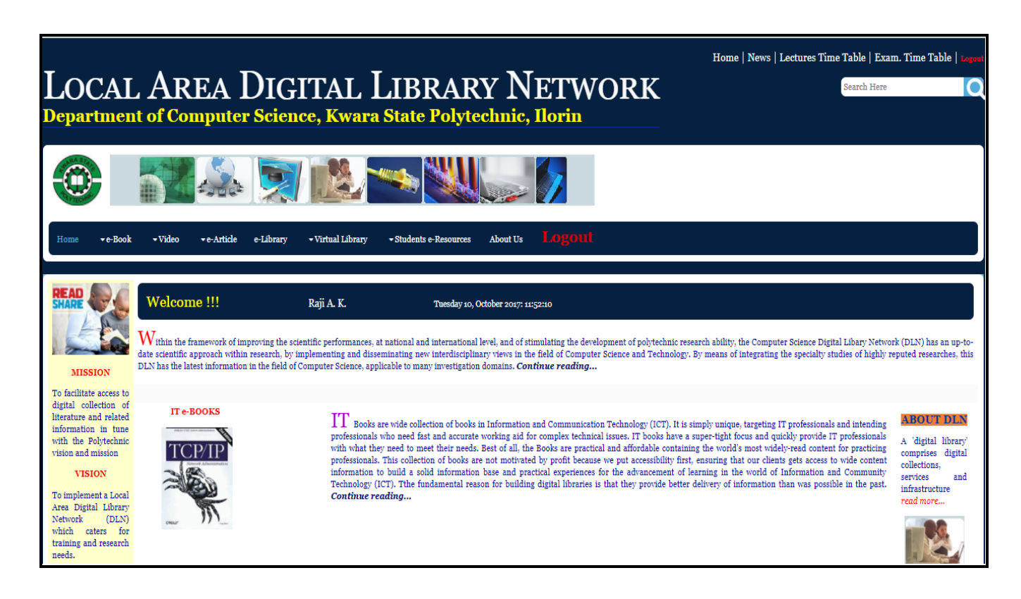
Figure 3: Screenshot showing home page of the digital library